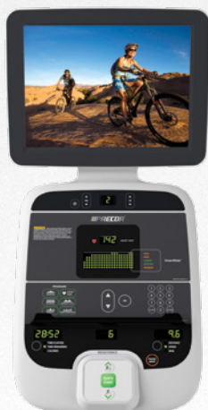
Streamlined LED Console with optional 15" Personal Viewing System